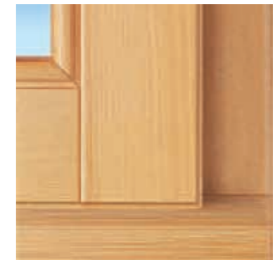
Bottom Corner - Timber