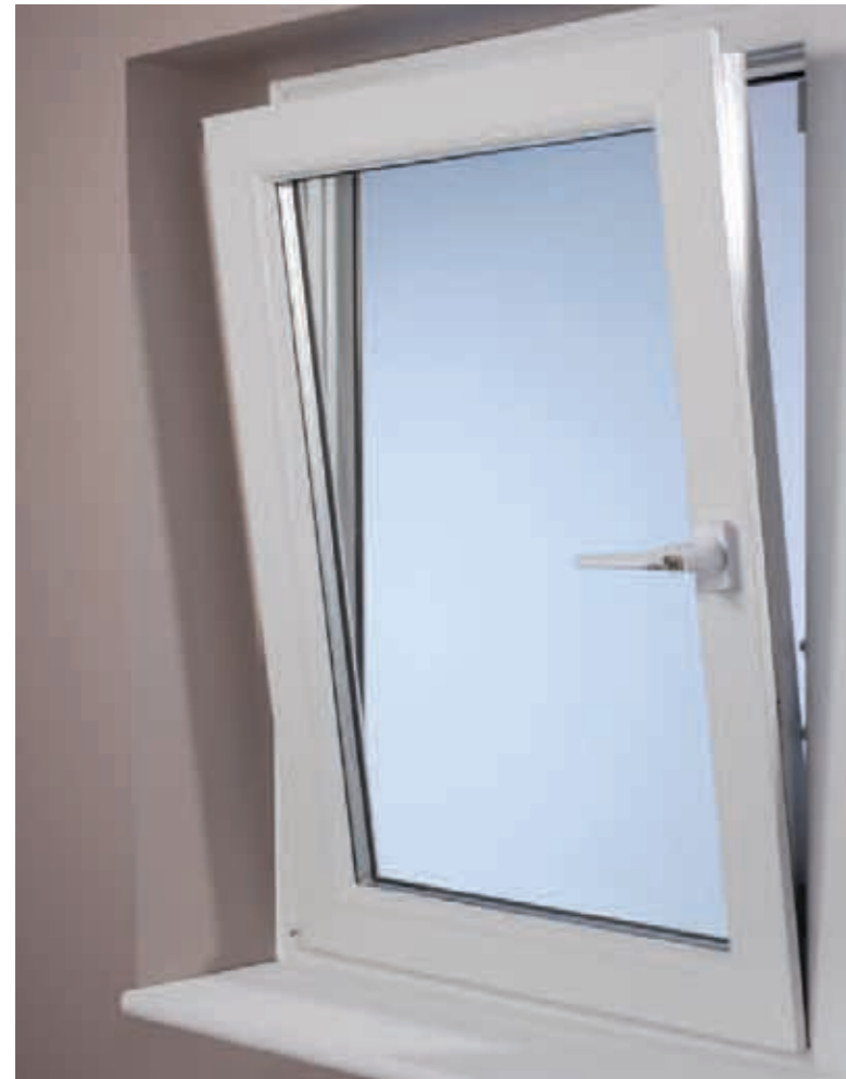
Tilt position for ventilation