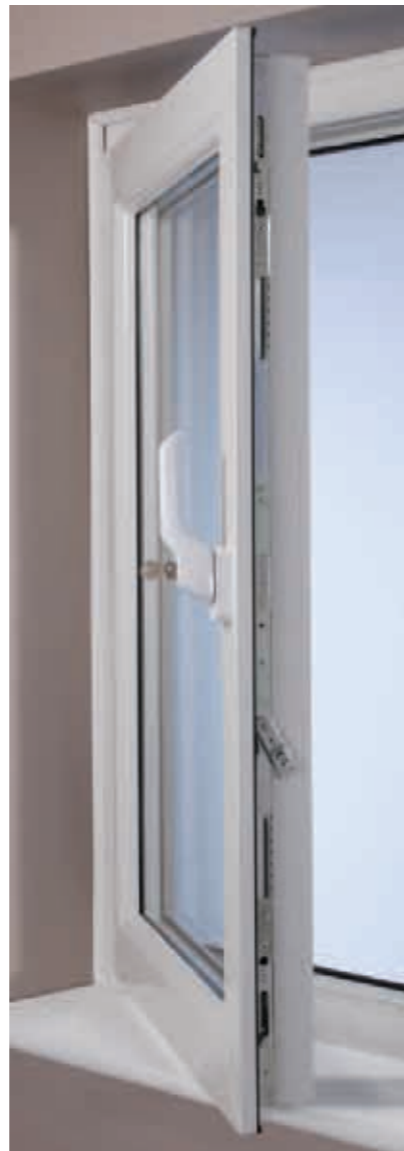
Turn position for cleaning