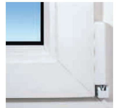
Bottom Hinge - PVCu