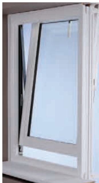
Top Swing fully reversed position