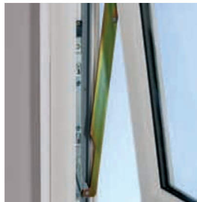
Top Swing restricted position