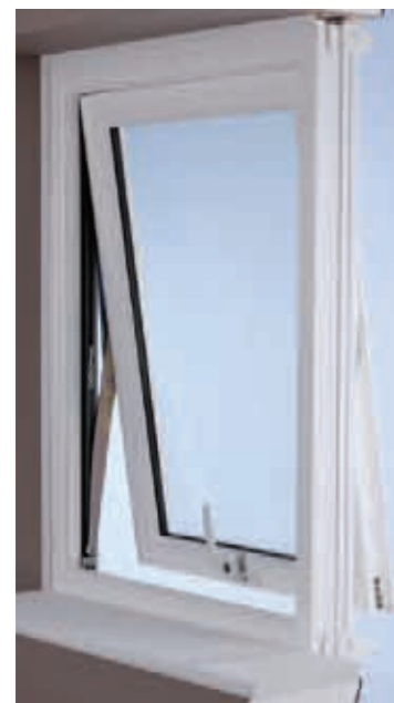
Top Swing open position