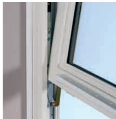
Top Swing reverse position