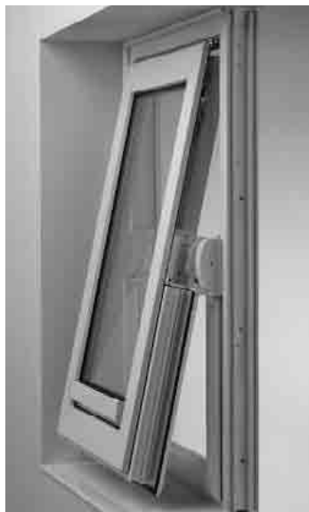
Fully reversed position