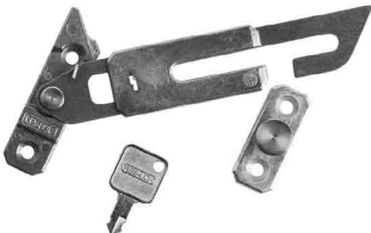
For open out