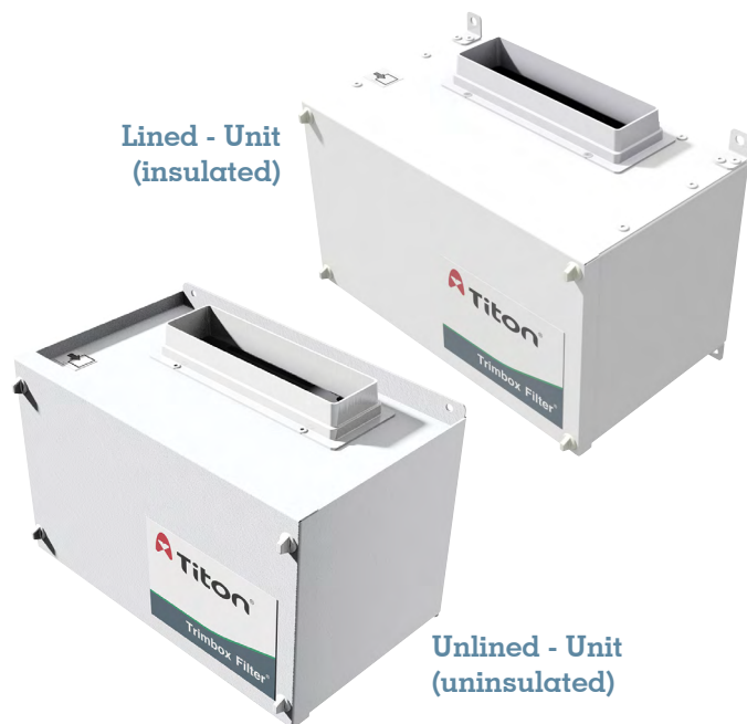
Lined - Unit (insulated)