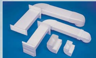
System 100, 125 & 150