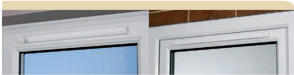
Gas Regulations Ventilator