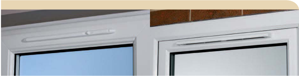
Trimvent® Select Xtra S13 Ventilator