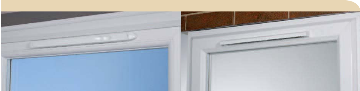
Trimvent® Select Xtra S16 Ventilator