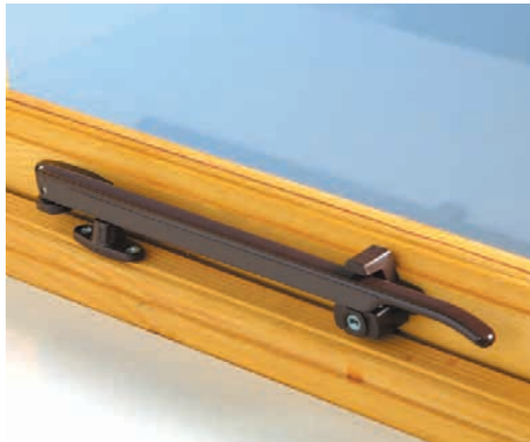
Casement stay with locking rest

Stay features a compact design and comes with a variety of accessories including pegs and rests.