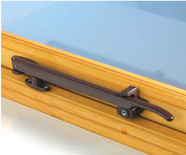
Casement stay with locking rest

Stay features a compact design and comes with a variety of accessories including pegs and rests.