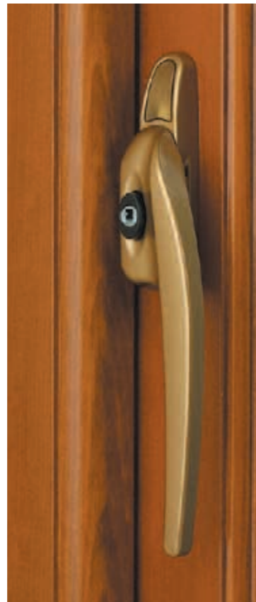
Right hand - gold paint